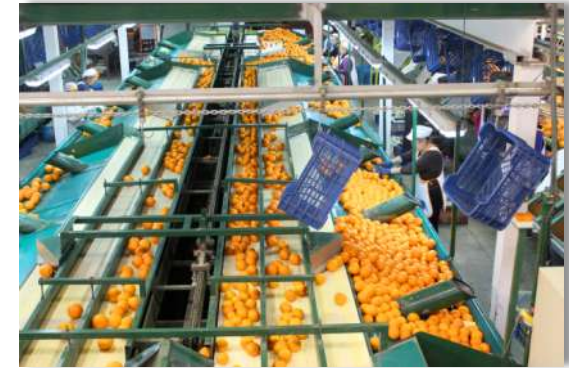
Evolution of the amount of the aid for market withdrawal and non-harvesting